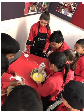
LN3 - A Week In Review

Week 3 has finished, which means there is only four more weeks to camp! Students that are attending camp will receive a booklet next week to help them get ready for the experience, there is an important clothing list to help families prepare and get organised. If anyone has any questions or queries please see one of the LN3 teachers. Grade 6 graduation preparations are underway. The students have started practicing their big dance piece and preparations have begun for their speeches, videos and ceremony.